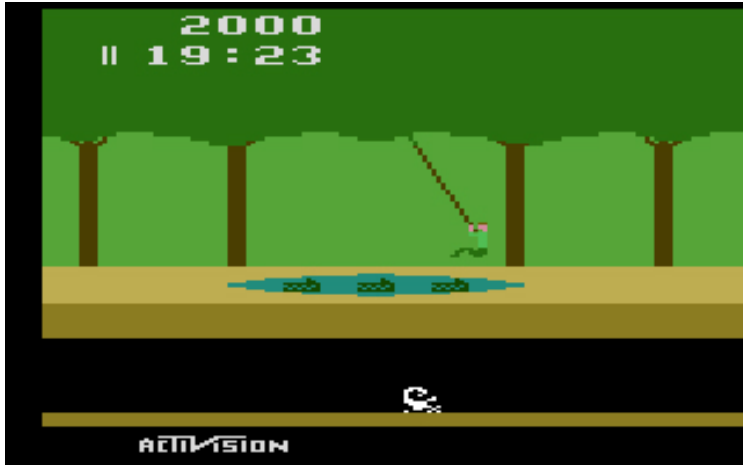
Fig. 6: PITFALL! ( www.atariage.com )

On the other hand, what can be called the Wittgensteinian world-view is what is typically referred to as first person perspective. According to Ludwig Wittgenstein (1961) the ego “does not belong to the world,” but must be defined as its “limit,” which, again, is an eminent phenomenological insight: for instead of claiming the existence of a first person, this observation describes what it means to be in the position of it. Finally, this is why in respect to the space-image it is unfounded to refer to games such as MAX PAYNE (2001) as “third person shooters.” Here seeing and acting have nothing to do with the Cartesian situation. What in narratological respect is classified as a semi-subjective view can be addressed accurately as “heautoscopy”; a partial disembodiment in which the cogito is still restricted by the limits of the corporeal range.