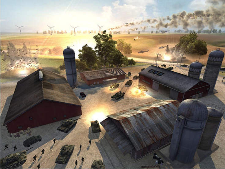
Fig. 3: WORLD IN CONFLICT ( www.worldinconflict.com )

Granted, a description based purely on visual aspects would be incomplete and would also have to take into account the possibilities of interaction. This is precisely what Fernández-Vara et al. did when they reflected on the phenomenological possibility of action space, and the results of their labor show that it is possible to have different dimensions of visibility and of interactivity (cardinality), and that both are limited in different ways. It is possible for there to not even be a visible dimension at all, but interactivity (an interactive picture) – indeed, a game – requires “more than one direction.” Even though it is possible to program it, the result is that of a non game, as is the case in the experimental TETRIS 1D (2002), in which players score points by doing nothing and merely watching the bricks fall down, only able to speed them up. As the pieces are all only one brick wide, adjusting them does not pose a challenge.