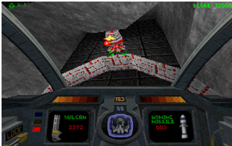
Fig. 2: DESCENT

game world even though three dimensions are displayed. In contrast, in DESCENT (1995) the player can steer a vehicle continuously in any direction of a three-dimensional space. This is a fundamental difference: as the first version of QUAKE shows, three-dimensional game-play results in a different (two handed) interface-configuration, which in turn means a different game(space)-experience.