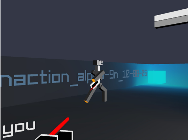
Fig. 5: 2 ND PERSON-MISSING-IN-ACTION ( selectparks.net )

At this level of game space, one must also make note of what, in philosophical terms, could be called the difference between a Cartesian ontology and a Wittgensteinian world-view, which addresses the status of the avatar. In PITFALL! (1982) the user has to react to the world as if Cartesian ontology applied, i.e. the player is excluded from game space as res extensa and is situated in the place of the res cogitans . The underlying projection is of parallel or isometric nature: it is neither subjective in the sense of the first person, nor is it omniscient, observing the whole territory of play. Here, the distance from the world to the point of action is characterized not by a possible range, but rather by total disjunction. This is, indeed, a third person perspective in the most literal sense, a situation in which the “avatar” at point of action is perceived by the player as a “he,” “she,” or “it,” and not as “me.” The game space is a “representation” in the full Cartesian sense of the word: it is represented to the autonomous ego (the user in front of the screen), who is not involved as a first person, either visually or interactively.